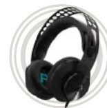
Legion H300 Stereo Gaming Headset