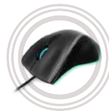
Lenovo Legion M500 RGB Gaming Mouse