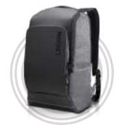
Lenovo Legion 15.6" Recon Gaming Backpack

* Example of Lenovo Legion catalogue naming convention