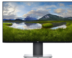
DELL ULTRASHARP 24 MONITOR - U2419H

23.8" ultrathin bezel optimized for dual display productivity. Easy Arrange feature enables multitasking efficiency and its small base frees valuable workspace.