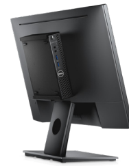
OPTIPLEX MICRO ALL-IN-ONE MOUNT FOR DELL E SERIES MONITORS

Small footprint mounting solution adapts to your environment, with cable management and monitor height adjustability, tilt, swivel and pivot functions.