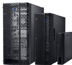
OPTIPLEX CABLE COVERS

Communicate clearly with a headset optimized to provide in-person sound quality, certified for Microsoft Skype for Business.