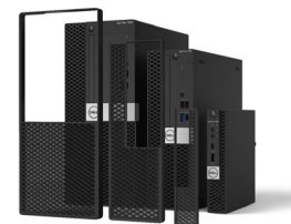
OPTIPLEX DUST FILTERS

Thermally tested custom cable covers offer an easy to install and attractive way to manage cables and secure ports.